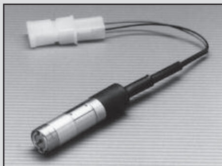
BMP-1 marker probe with receptacle.

EXT-BMP: Receptacle extraction tool for BMR-1.